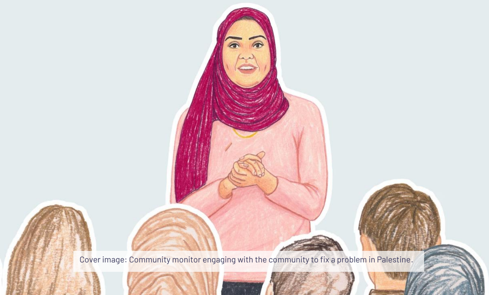
Cover image: Community monitor engaging with the community to fix a problem in Palestine.